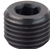
STEEL / STAHL