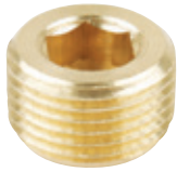
BRASS / MESSING