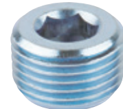
STAINLESS STEEL / EDELSTAHL